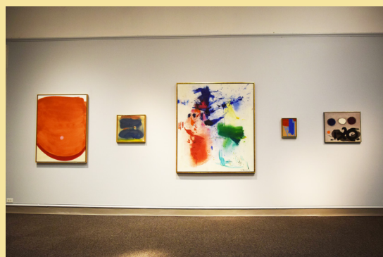
From L to R: Jules Olitski (American, born in Ukraine, 1922 – 2007), New Love, 1964, acrylic on canvas, 46 1/2 x 35 inches ; Helen Frankenthaler (American, 1928 – 2011), Untitled, 1965, oil on canvas, 18 x 19 inches ; Hans Hofmann (American, born in Germany, 1880 – 1966), Furioso, 1963, oil on canvas, 60 x 52 inches ; Robert Motherwell (American, 1915 – 1991), Spanish Death VI, 1977, acrylic on canvas, 12 x 9 inches ; and Adolph Gottlieb (American, 1903 – 1974), Shadows & Halos, 1968, oil and enamel on canvas board, 20 x 24 inches